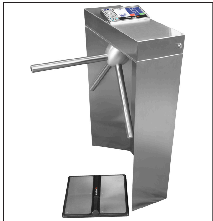
Figure 3. Completing the installation