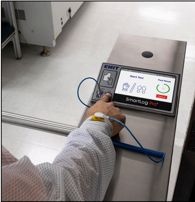
Figure 6. Performing a wrist strap test