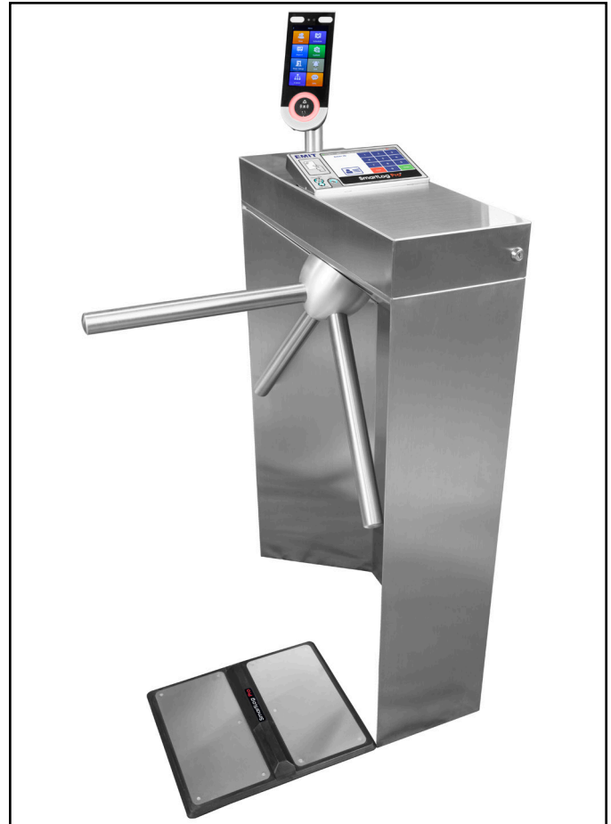
Figure 7. EMIT 50177 Facial Recognition Terminal paired with the 50182 Turnstile and SmartLog Pro® 2

The EMIT 50177 Facial Recognition Terminal is designed to be used with the SmartLog Pro® 2 to test operators that wear foot grounders or wrist straps. The biometric reader uses facial features to identify the operator and can be set to limit access based on the operator's temperature or if the operator is wearing a mask. Verified scans override the test switch on the personnel tester and allow operators to perform tests without contact. All EMIT turnstiles are constructed with a mounting cutout for the 50177 Facial Recognition Terminal.