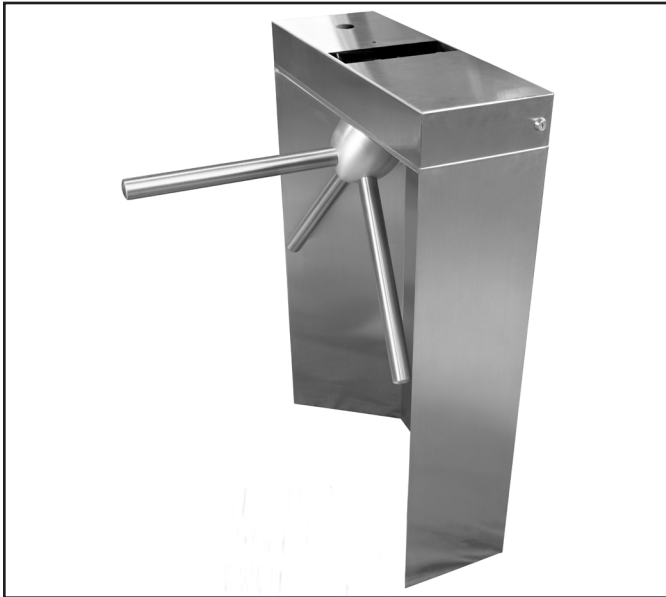
Figure 1. Alvarado EDC Turnstile for SmartLog Pro® 2