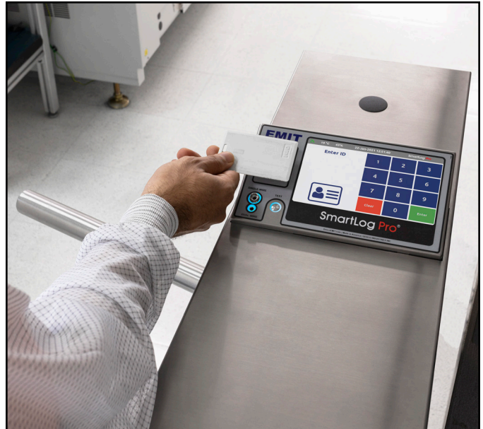
Figure 4. Holding a proximity badge in front of the RFID icon on the SmartLog Pro® 2

*The SmartLog Pro® 2 may also be used to test smocks or garments that feature a grounding mechanism for operators using a coiled cord connection.