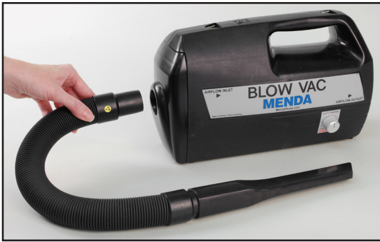
Figure 3: Connecting the hose to the airflow inlet.