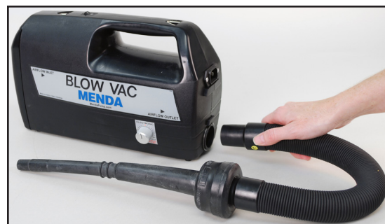
Figure 2: Connecting the hose to the airflow outlet.