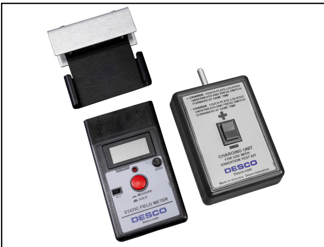
Figure 2. Desco 19443 Air Ionization Test Kit