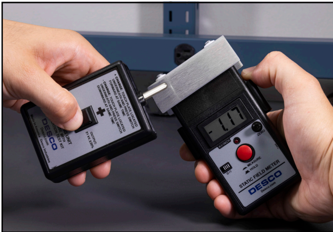
Figure 10. Using the Charger to apply a charge onto the Conductive Plate

NOTE: A ground path must be provided between the touch plate of the Charger and the ground reference of the Digital Static Field Meter. This is normally provided by holding the Charger in one hand and the Digital Static Field Meter with Conductive Plate in the other.