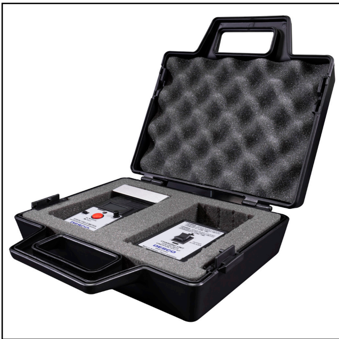
Figure 3. Air Ionization Test Kit and Carrying Case