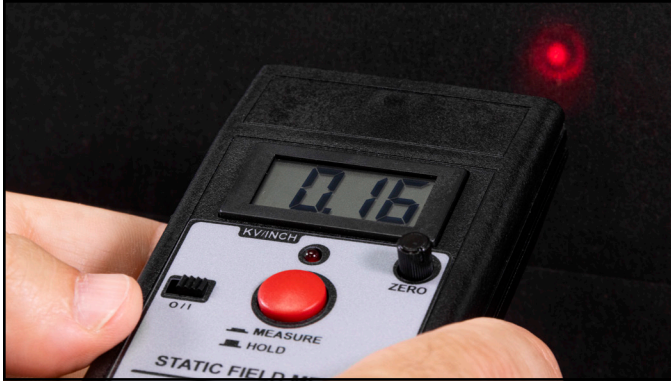
Figure 7. Aligning the two bullseyes emitted by the LED range indicator