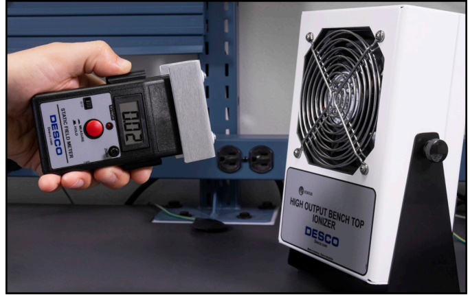
Figure 9. Using the Digital Static Field Meter with Conductive Plate to measure the offset voltage of a benchtop ionizer

NOTE: When testing pulsed ionizer systems, the voltage displayed is constantly changing. This pulse rate may be faster than the display update rate of the Digital Static Field Meter, therefore the displayed voltage is an average of the actual voltage. The output of the Digital Static Field Meter is useful in this situation for more accurate measurements.