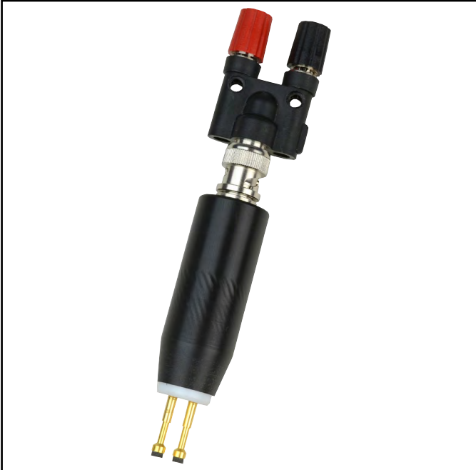
Figure 1. Desco 19297 Two-Point Resistance Probe