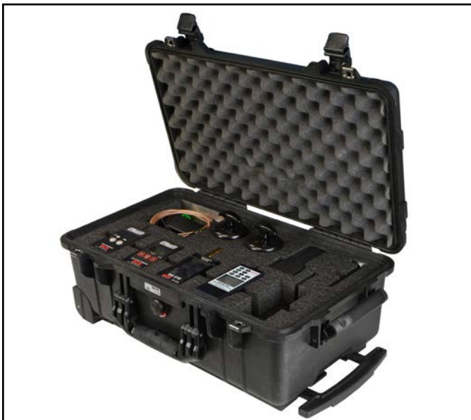
Figure 2. SCS 752 EOS/ESD Audit Kit, Premium