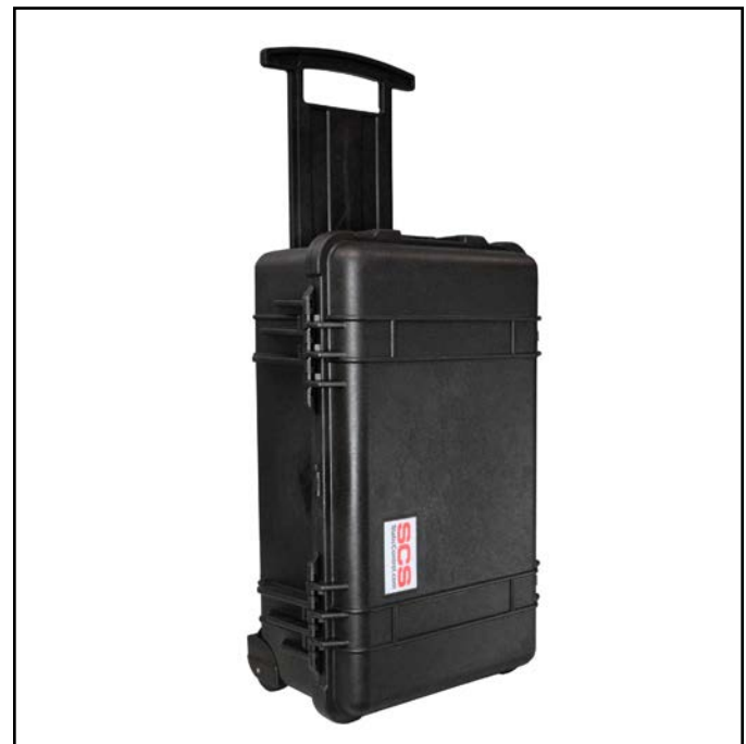
Figure 3. Extendable handle on the carrying case