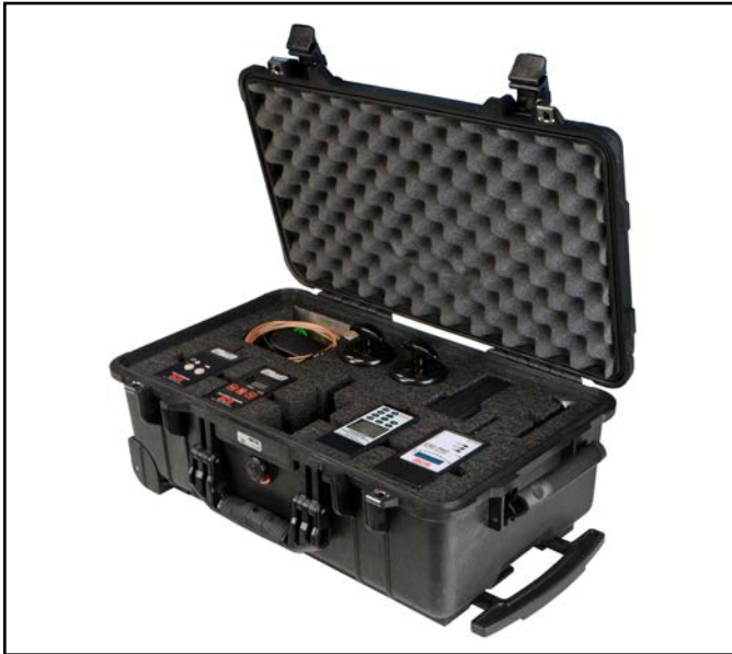
Figure 1. SCS 751 EOS/ESD Audit Kit, Standard