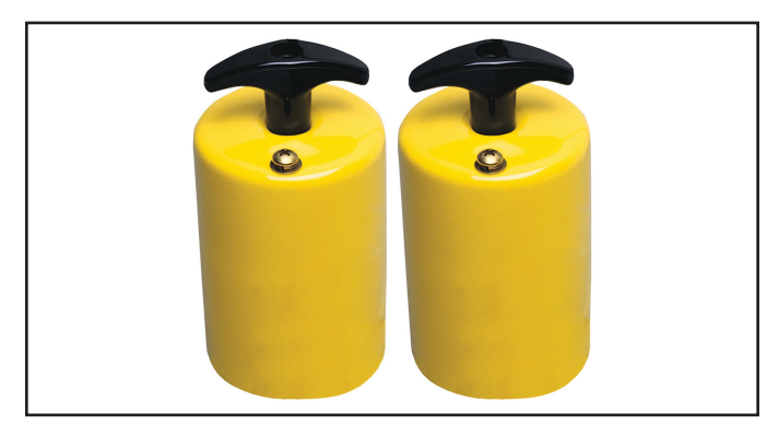
Figure 3. SCS 770767 5-Pound Electrodes

NOTE: Two 5-pound electrodes are required to complete this procedure. The electrodes provide a method for loading the resistance from the Limit Comparator onto each of the dual foot plate's plates. One pair of 5-pound electrodes are available as SCS item 770767.