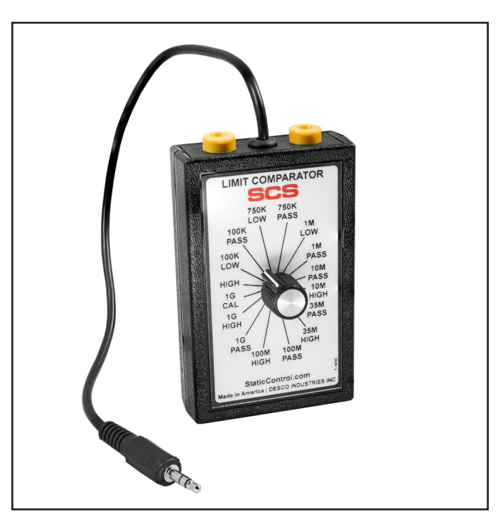
Figure 1. SCS 770769 Limit Comparator