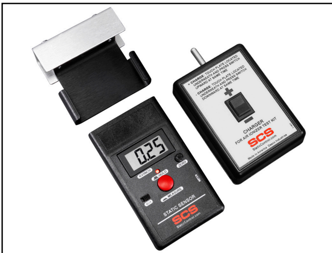
Figure 2. SCS 770717 Air Ionizer Test Kit