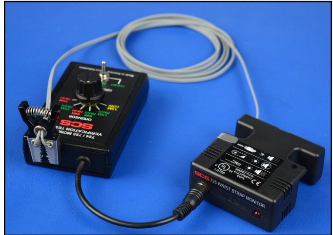
Figure 4. Using the Verification Tester with the 725 Portable Wrist Strap Monitor