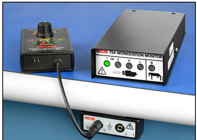
Figure 3. Using the Verification Tester with the 724 Workstation Monitor