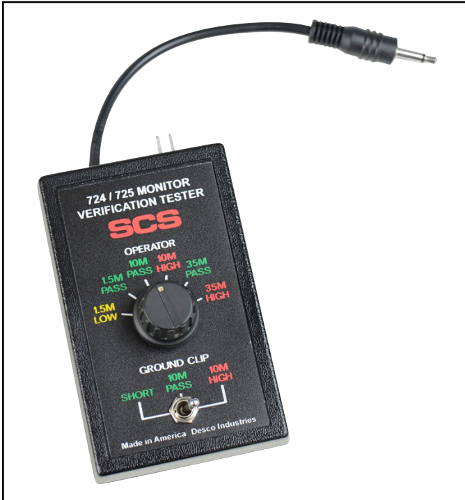
Figure 1. SCS 770065 Verification Tester