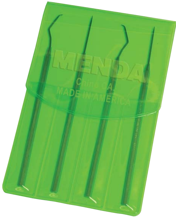
Item 35631 - KIT OF ALL FOUR PROBERS IN NEON GREEN VINYL POUCH WITH INDIVIDUAL POCKETS.