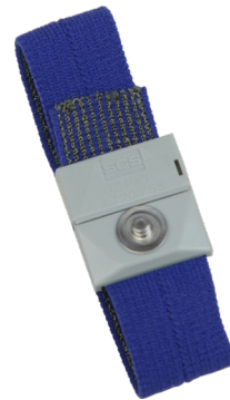
Blue Wrist Band