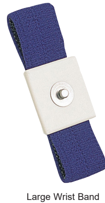
Large Wrist Band