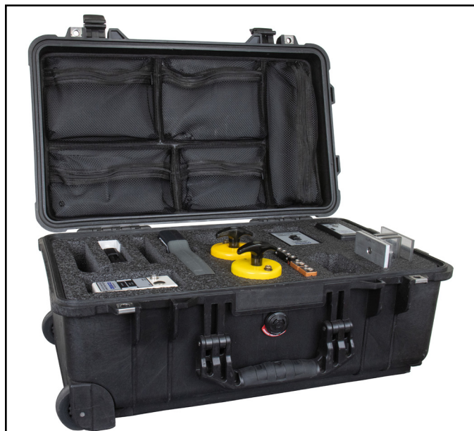
Figure 2. Desco Europe 222698 ESD Survey Kit, Europe