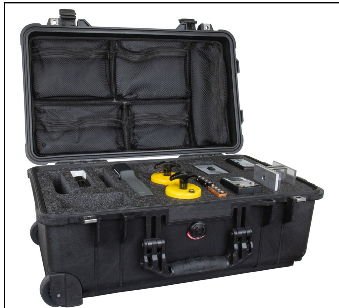
Figure 1. Desco Europe 222697 ESD Survey Kit, UK