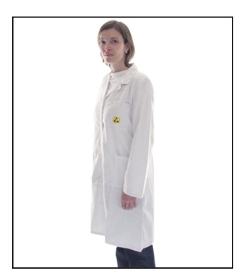
Figure 1. Vermason Female ESD Lab Coat