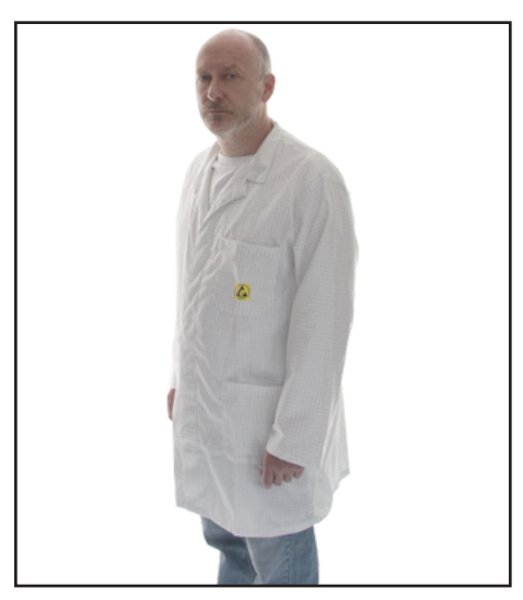
Figure 2. Vermason Male ESD Lab Coat