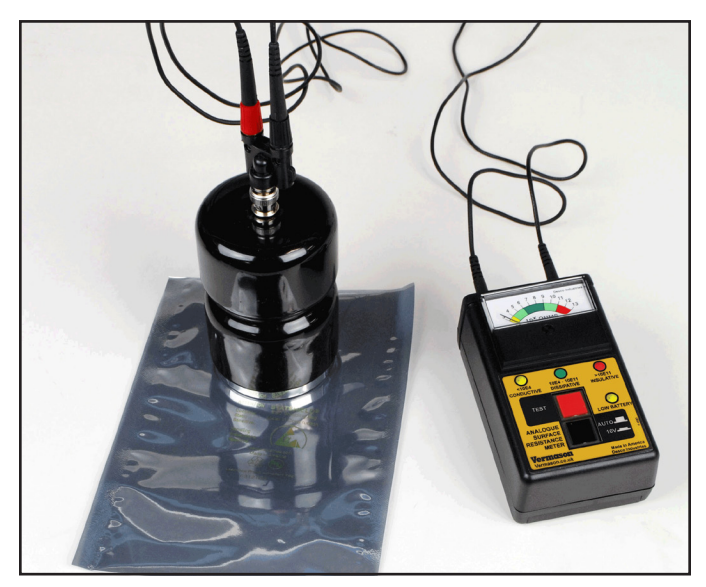
Figure 4. Using the Concentric Ring Probe with the Vermason Analogue Surface Resistance Meter