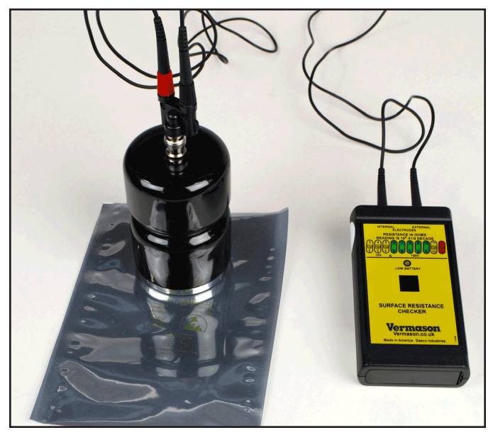
Figure 5. Using the Concentric Ring Probe with the Vermason Surface Resistance Checker