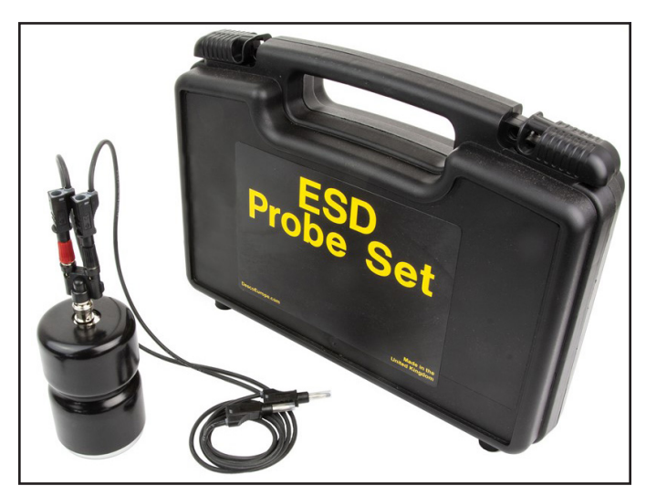
Figure 2. Desco Europe 222003 Concentric Ring Probe Kit