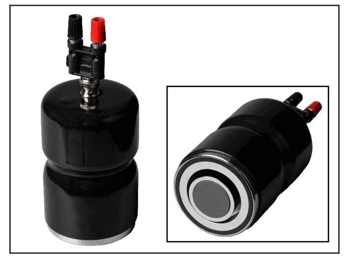
Figure 1. Desco Europe 222002 Concentric Ring Probe