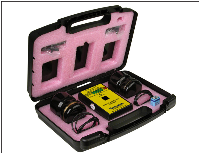
Figure 2. Vermason 225718 Surface Resistance Checker Kit