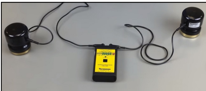
Figure 5. Using the test leads and 2.27 kg electrodes to measure Rp-p