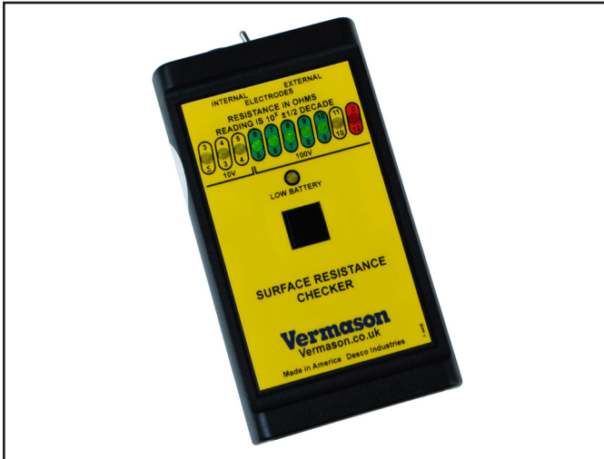
Figure 1. Vermason 225717 Surface Resistance Checker