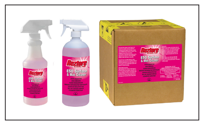
Figure 1. Reztore® Alcohol-Free ESD Surface & Mat Cleaner: 16 Ounces (450 ml) Spray Bottle 1 Quart (950 ml) Spray Bottle 2.5 Gallons (10 liters) Bag-in-Box