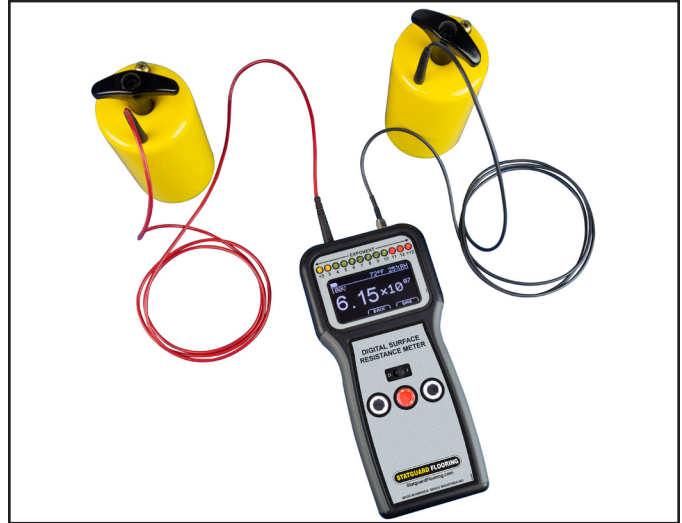
Figure 2. D19290 Statguard Flooring Surface Resistance Meter Kit

Test the surface resistance point to point (Rtt or Rtg), and resistance-to-ground (Rtg or Rg) properties of coated area per ANSI/ESD S7.1 or Compliance Verification ESD TR53 at initial installation and quarterly. For quick and easy verification of the coating, we recommend using a Desco Industries Surface Resistance Test Meter Kit.