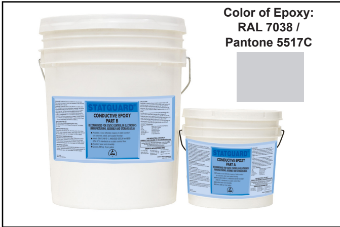
Figure 1. Statguard® Conductive Epoxy, Parts A and B