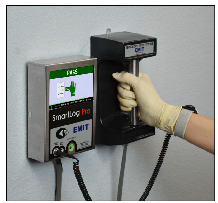
Figure 5. Using the ESD Glove Test Fixture with the SmartLog Pro®

*The SmartLog Pro® and Combo Tester X3 Plus may also be used to test smocks or garments that feature a grounding mechanism for operators using a coiled cord connection.