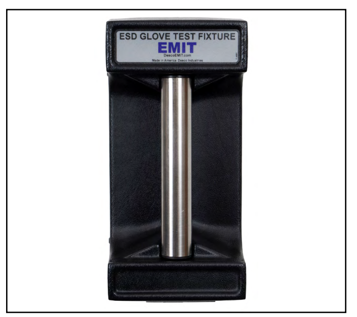
Figure 1. EMIT 50755 ESD Glove Test Fixture