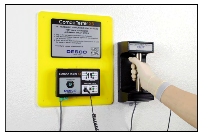
Figure 6. Using the ESD Glove Test Fixture with the Combo Tester X3

4. The relay terminal will activate if the defined tests are passed (if applicable).