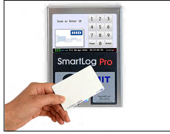
Figure 4. Holding a proximity badge in front of the RFID icon on the SmartLog Pro®

NOTE: Hold the proximity badge in front of the RFID icon for a full second if using proximity badges. See Figure 4.