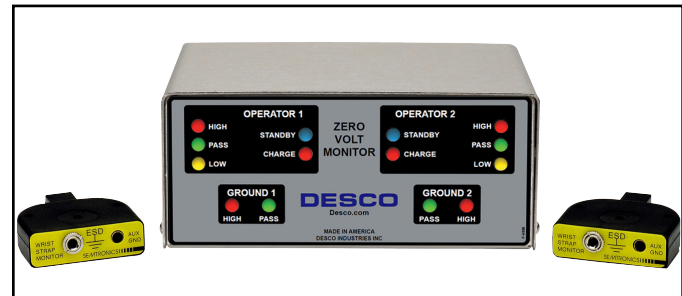
Figure 2. Desco 19668 Zero Volt Monitor