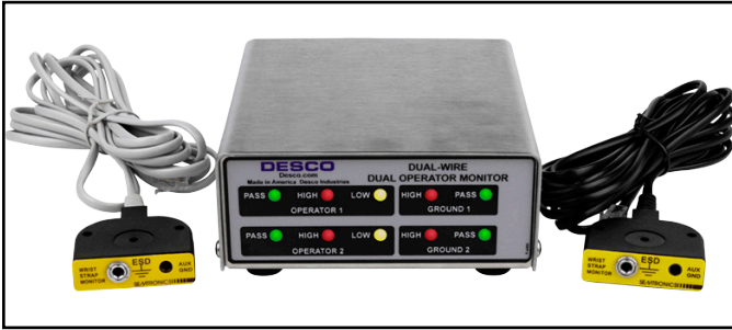
Figure 3. Desco 19662 Dual-Wire Dual Operator Monitor