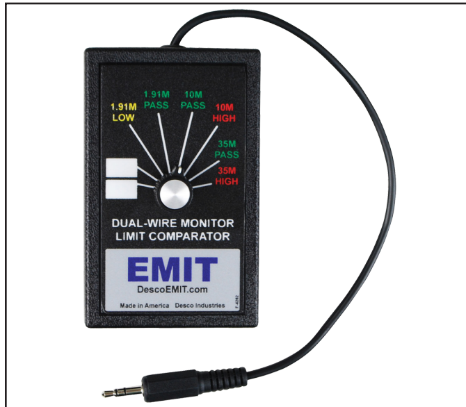
Figure 1. EMIT 50524 Limit Comparator