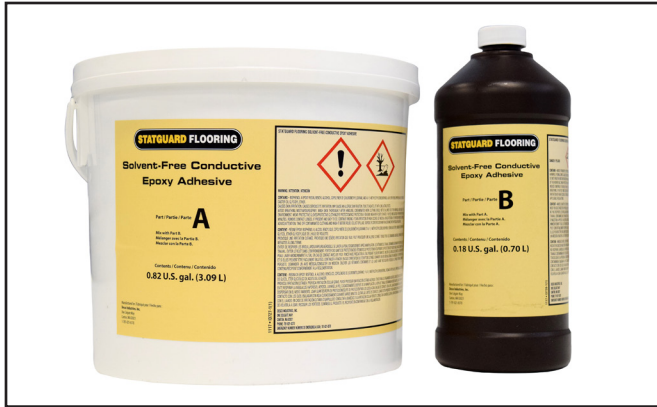
Figure 1. 8453 Conductive Epoxy Adhesive