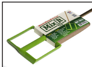
Figure 3. *Recommended Spindle: MixIt Tool by BuddyTools LLC