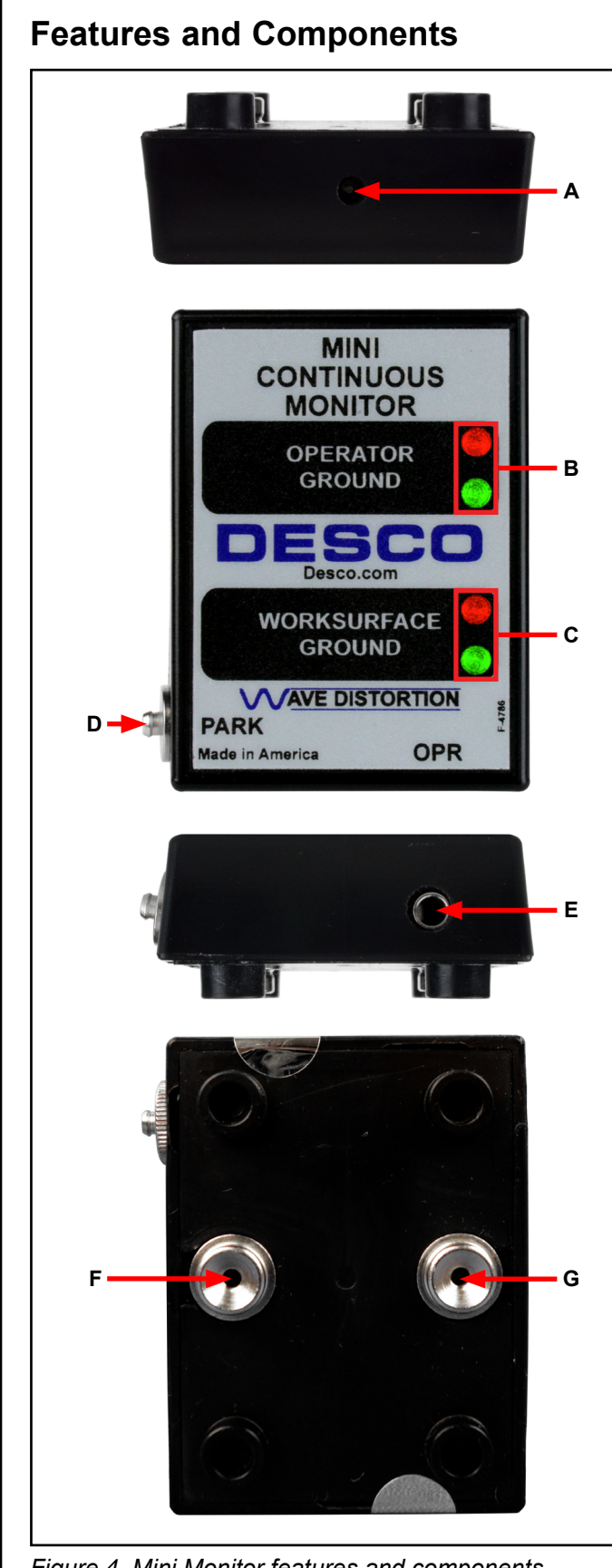
Figure 4. Mini Monitor features and components

A. Power Jack: Connect the included 24VDC power adapter here.