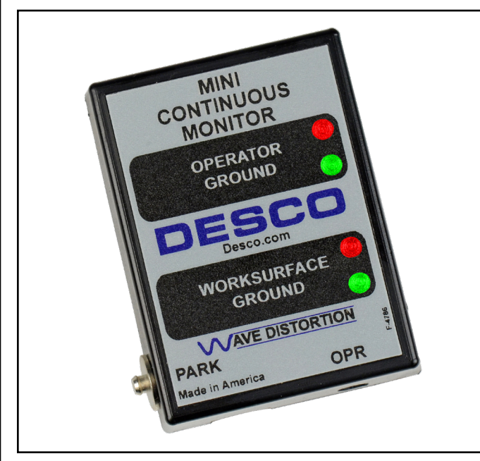
Figure 1. Desco Mini Monitor