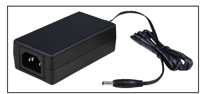
Figure 3. Universal power adapter included with the <u>19243</u> Mini Monitor

NOTE: The power cord must be purchased separately if ordering the <u>19243</u> Mini Monitor. The power cords are available as the following item numbers: