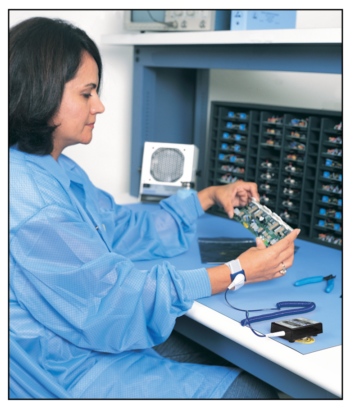
Figure 8. Using the Mini Monitor