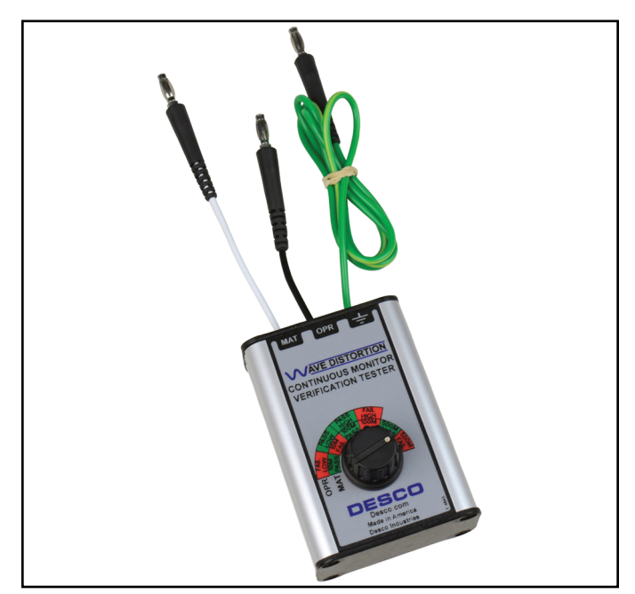
Figure 9. Desco <u>98221</u> Wave Distortion Monitor Verification Tester

See <u>TB-3074</u> for more information.