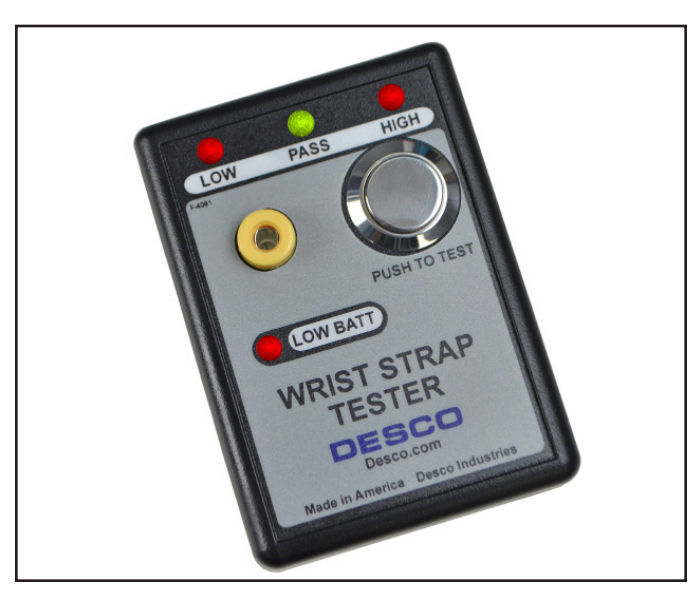
Figure 1. Desco 19240 Portable Wrist Strap Tester