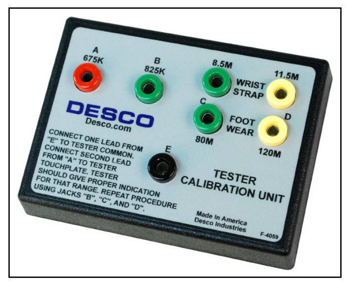
Figure 3. Desco 07010 Calibration Unit

View technical bulletin TB-2039 for more information.