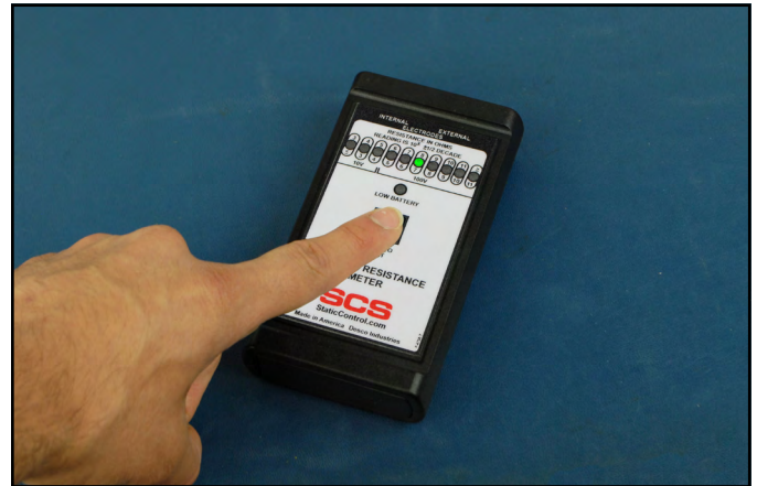
Figure 3. Using the parallel electrodes to measure surface resistance

If the measurement is outside acceptable limits, clean the surface with an ESD cleaner containing no insulative silicone such as Reztore® Surface & Mat Cleaner, and re-test to determine if the cause of failure is an insulative dirt layer or the ESD worksurface material.