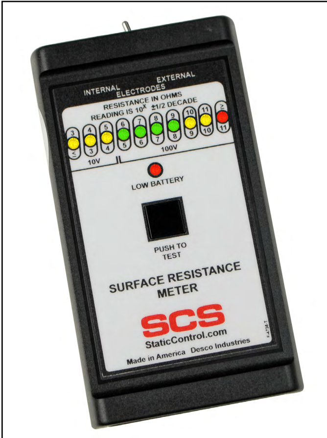
Figure 1. SCS SRMETER2 Surface Resistance Meter