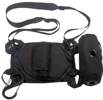
CARRY CASE Model 1008