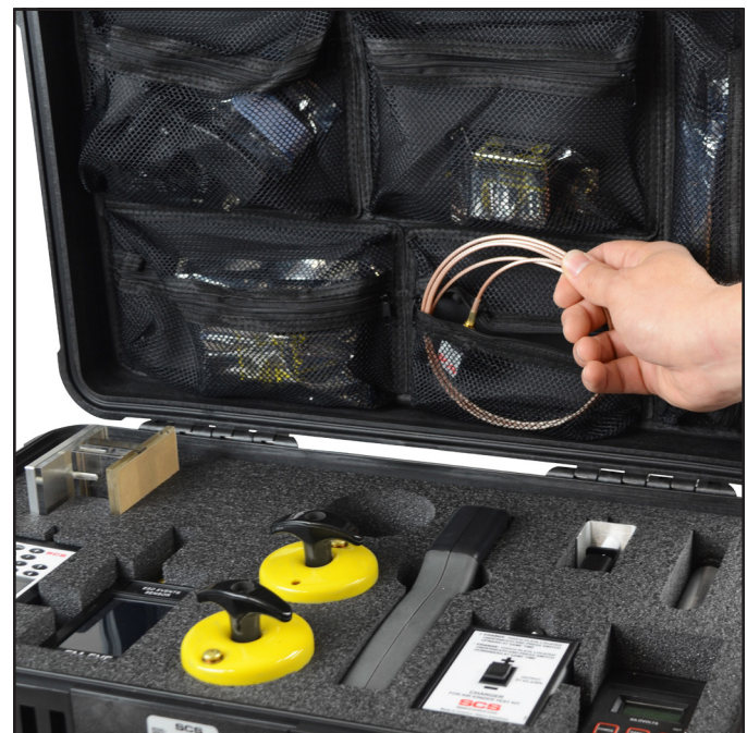
Figure 2. Using the EOS/ESD Assessment Kit's lid organizer

The ESD Program Standard ANSI/ESD S20.20 can be downloaded here: https://www.esda.org/standards/esda-documents/