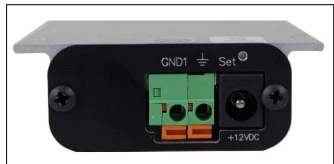
Figure 2. Rear view of Wrist Strap and Ground Monitor

Attach 18 AWG wires to the unit as described below. Strip back the vinyl insulation at each end of the wires to approximately 1/3 inch (8 mm). Twist the stranded wire on each end before inserting the wire into each connector location. In order to attach the wire, insert a small blade screwdriver into the orange slot above. Gently push inward and insert the stripped wire fully into the hole in the green connector. Hold the wire fully in and release the screwdriver to allow the wire to catch. Attach the green monitor ground cord to the ground connector on back of unit. Attach the impedance monitor wire to the “GND1” connector on the back of the unit.