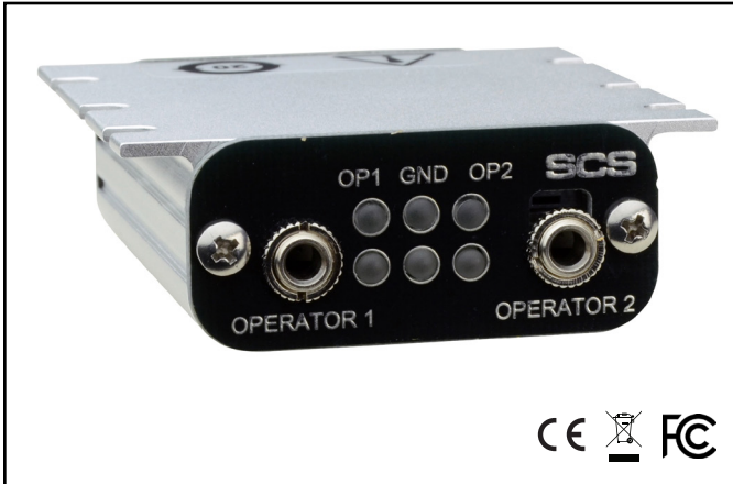
Figure 1. SCS CTC337 Wrist Strap and Ground Monitor