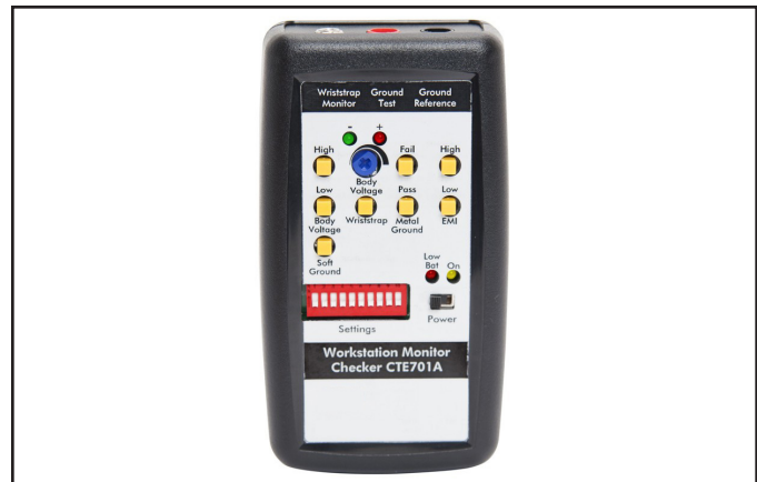
Figure 3. SCS CTE701 Workstation Monitor Checker

The checker verifies the proper operation of dual wrist strap monitoring. Connect a 3.5 mm test cable to both the checker and to the operator jack of the monitor. At this point the monitor should indicate failure. Depress the Pass button on the wrist strap section. The monitor should indicate a good connection. While pressing the Pass button, press body voltage “high.” At this point the Wrist Strap LED would be blinking red.