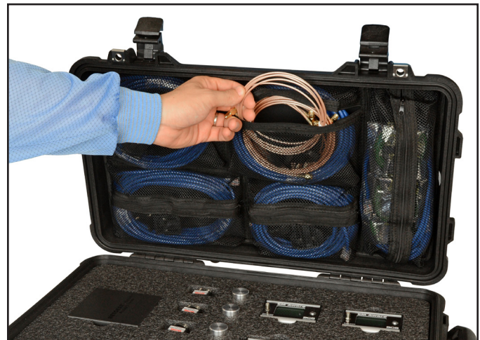
Figure 2. Using the the lid organizer to store accessories

Per ANSI/ESD S20.20 section 6.1.3.1 Compliance Verification Plan Requirement “A Compliance Verification Plan shall be established to ensure the organization’s compliance with the requirements of the Plan. Formal audits or certifications shall be conducted in accordance with a Compliance Verification Plan that identifies the requirements to be verified, and the frequency at which those verifications must occur. Test equipment shall be selected to make measurements of appropriate properties of the technical requirements that are incorporated into the ESD program plan.”