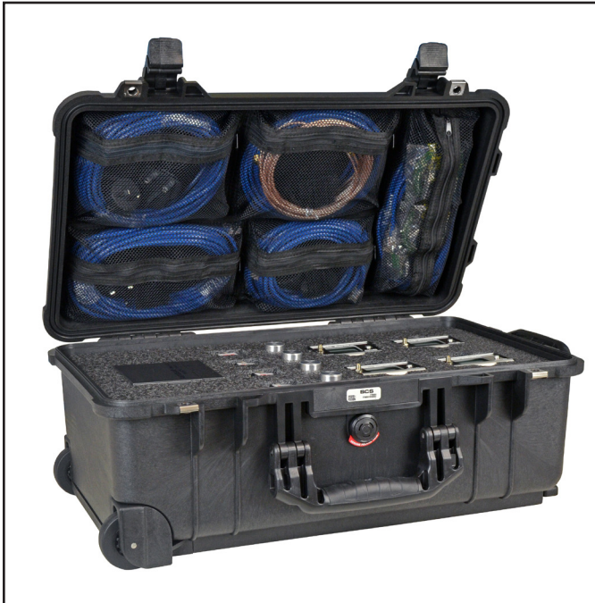
Figure 1. SCS 770051 ESD Event Diagnostic Kit