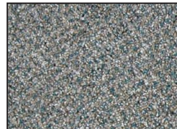
Item 81410, Forest Jade