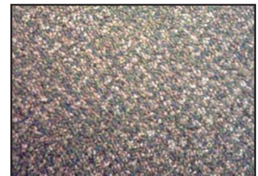
Item 81415, Autumn Sun