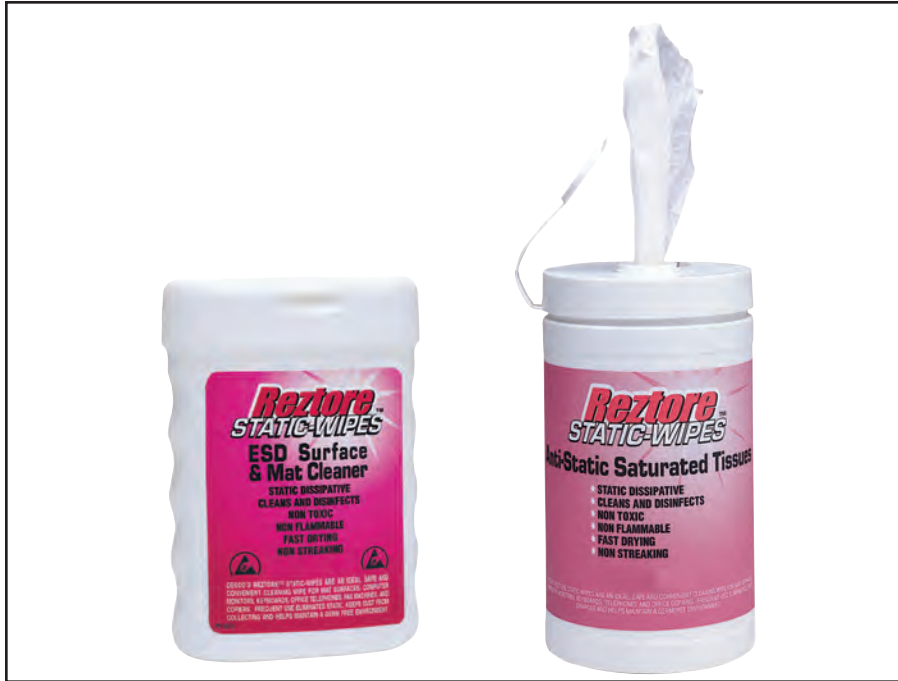
Figure 1. Reztore™ Static-Wipes: 60 Wipes in an Anti-Static Canister 160 Wipes in an Anti-Static Canister