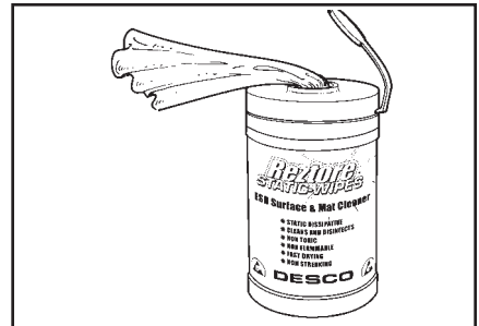
Figure 2. When separating a tissue, tear at an angle.

Lift the container cover from the canister and remove the seal from the lip of the container. Locate the first wipe in the center of the roll of wipes. Feed and push the first wipe through the hole in the center of the top cover and firmly re-attach the cover to the canister.