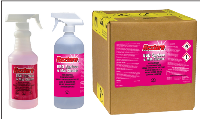
Figure 1. Reztore® Surface & Mat Cleaner: 16 Ounces (500 mL) Spray Bottle 1 Quart (1 liter) Spray Bottle 2.5 Gallons (10 liters) Bag-in-Box