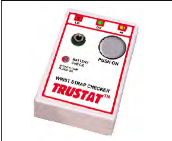
Figure 1. Model 04620 Wrist Strap Checker