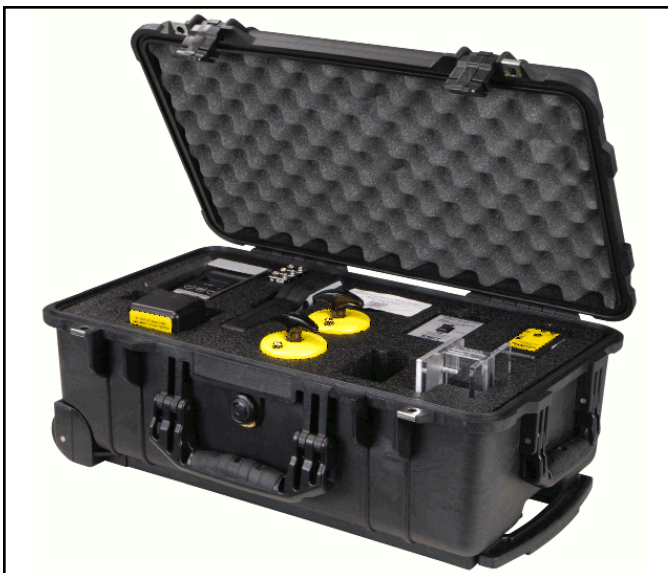
Figure 2. Vermason 222687 ESD Survey Kit, Europe, 220VAC