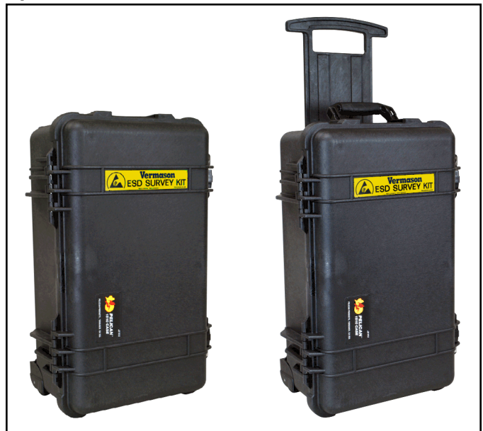
Figure 3. Extendable handle on the carrying case