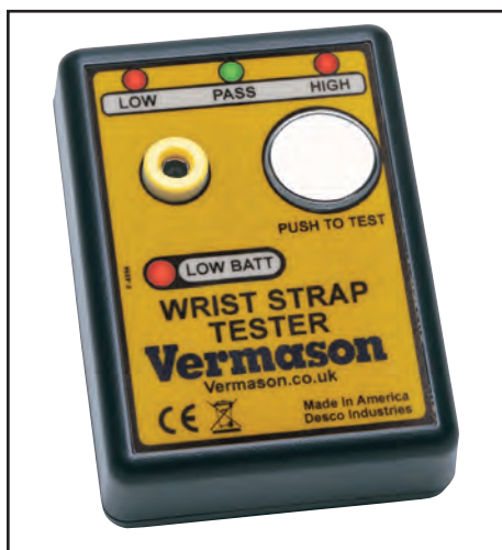
Figure 1. Model 225220 Wrist Strap Tester