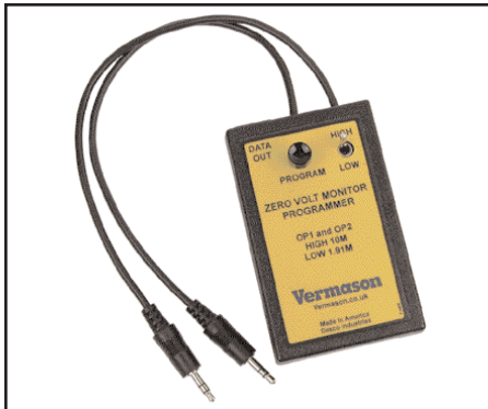
Figure 1. Vermason 222762 Zero Volt Monitor Programmer