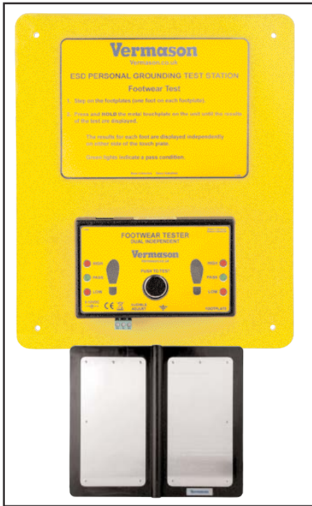
Figure 1. Vermason 222690 Dual Independent Footwear Tester and Dual Foot Plate