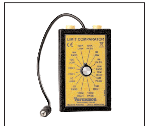
Figure 4. Vermason 222693 Limit Comparator

The Vermason Limit Comparator allows the customer to perform NIST traceable calibration on a number of Vermason Testers including the 222690 and 222700. The Limit Comparator can be used on the shop floor within a few minutes virtually eliminating downtime, verifying that the Dual Independent Footwear Tester is operating within tolerances.