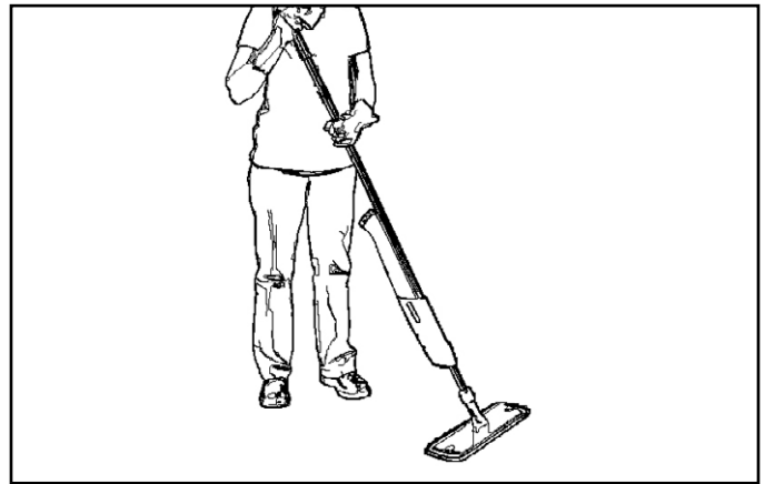
Figure 5. Applying floor finish with Flat Mop (optional).