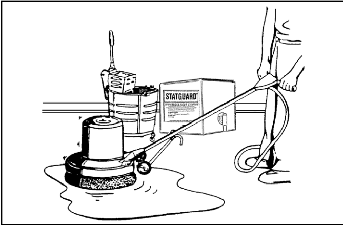
Figure 3. Stripping the floor