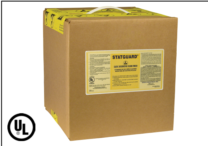
Figure 1. Statguard® Static Dissipative Floor Finish