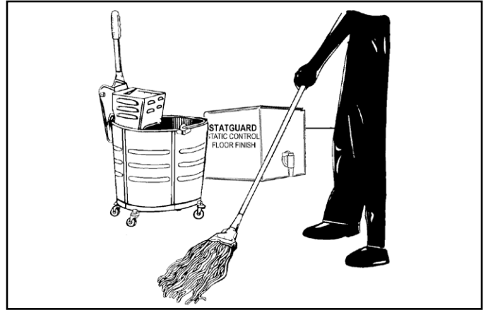
Figure 4. Applying floor finish