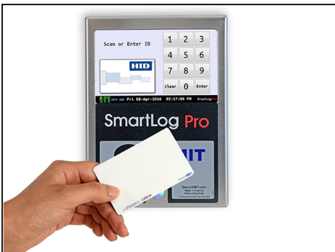
Figure 4. Holding a proximity badge in front of the RFID icon on the SmartLog Pro™

NOTE: Hold the proximity badge in front of the RFID icon for a full second if using proximity badges. See Figure 4.