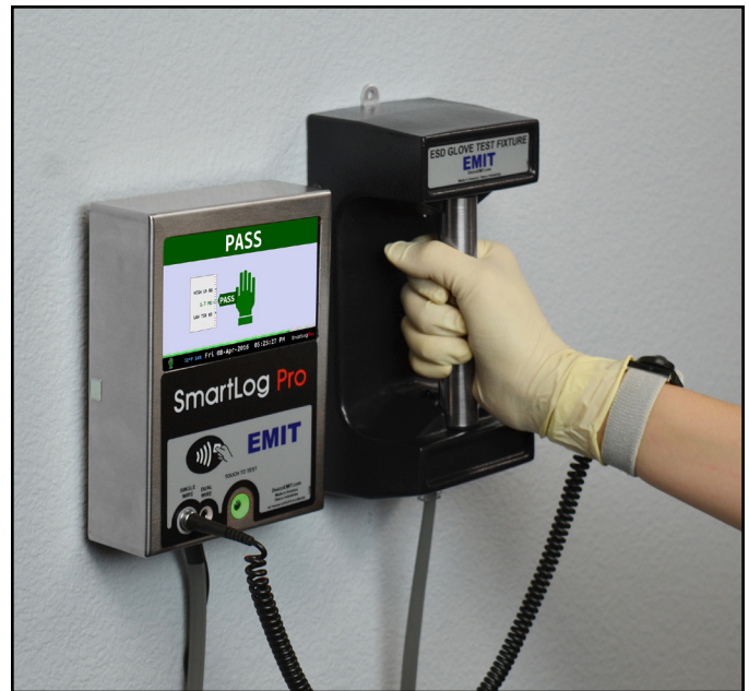
Figure 5. Using the ESD Glove Test Fixture with the SmartLog Pro™

*The SmartLog Pro™ may also be used to test smocks or garments that feature a grounding mechanism for operators using a coiled cord connection.