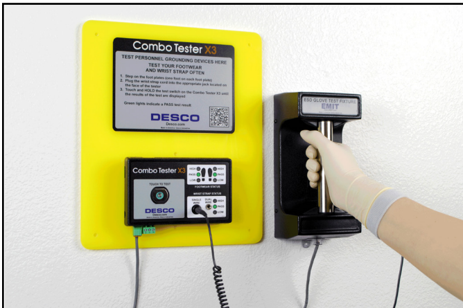
Figure 5. Using the ESD Glove Test Fixture with the Combo Tester X3

http://emit.descoindustries.com/Warranty.aspx