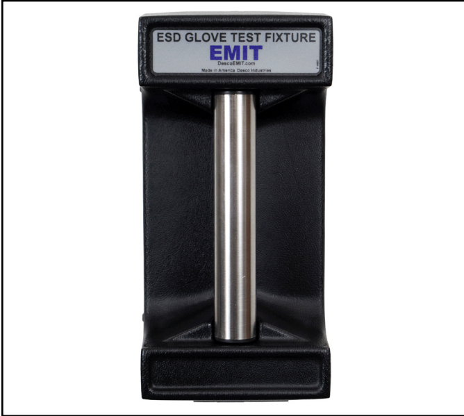
Figure 1. EMIT 50755 ESD Glove Test Fixture