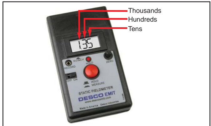
Figure 4. Reading the Digital Static Field Meter

Per ESD TR53-2006 Compliance Verification of ESD Protective Equipment and Materials Air Ionizer Test Procedure Initial Test Setup "Measurements should be made at the location where ESD sensitive items are to be ionized. Air ionizer heaters and air filters (if so equipped) should be left in their normal conditions during test."