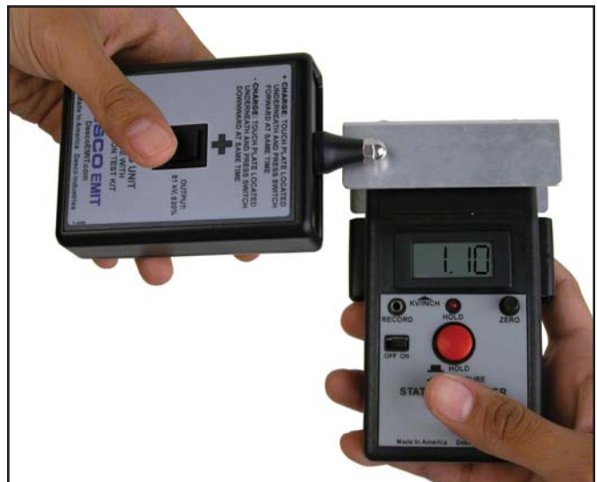
Figure 6. Taking decay measurements

To provide a NEGATIVE voltage output, touch the plate located underneath the charger, and press the switch downward at the same time. Momentarily touch the charger's output terminal to the conductive plate attached to the field meter. The meter reads approximately -1.10kV. By using a stop watch or other timing device, determine the