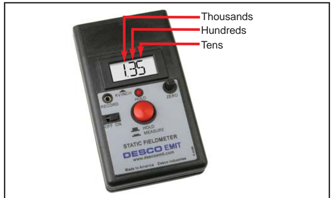
Figure 4. Reading the Digital Static Field Meter

Per ESD TR53-2006 Compliance Verification of ESD Protective Equipment and Materials Air Ionizer Test Procedure Initial Test Setup "Measurements should be made at the location where ESD sensitive items are to be ionized. Air ionizer heaters and air filters (if so equipped) should be left in their normal conditions during test."