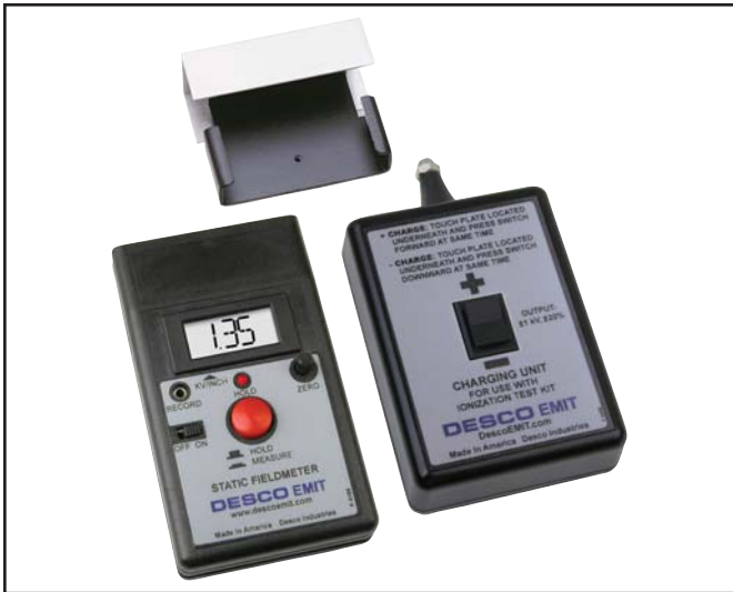
Figure 1. Desco EMIT 50592 Ionization Test Kit