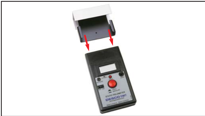
Figure 2. Installing the 50593 Conductive Plate

The Digital Static Field Meter's case has two slots along its slides. The top slot is closest to the front of the instrument. Slide down the tabs of the Conductive Plate into the top slot of the meter case as far as they go (see Figure 2).