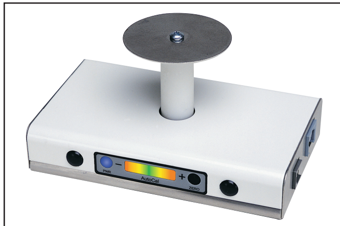
Figure 1. EMIT Auto Calibration Unit, Item 50610.