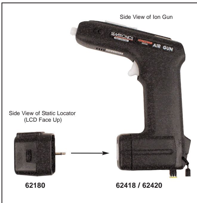
Figure 3. Connecting 62180 Semtronics Static Locator and 62418 / 62420 Semtronics Ion Gun