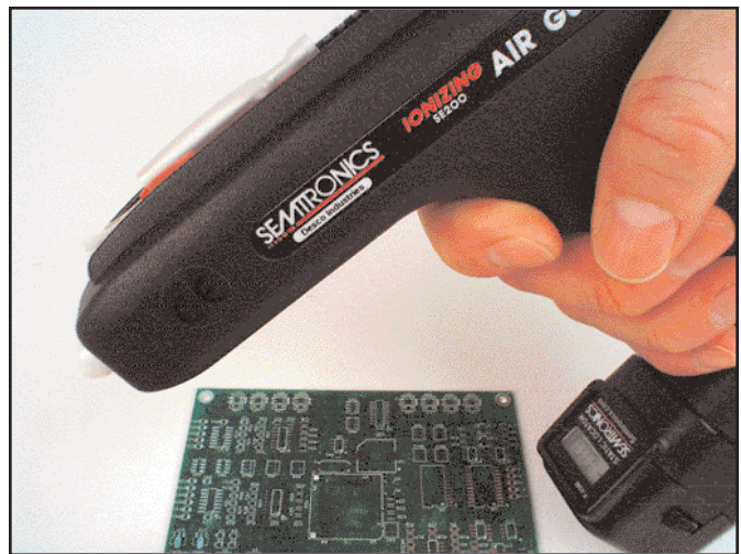
Figure 4. Using the Semtronics Static Locator with the Semtronics Ion Gun