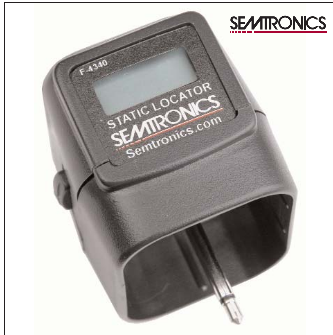
Figure 1. Semtronics Static Locator