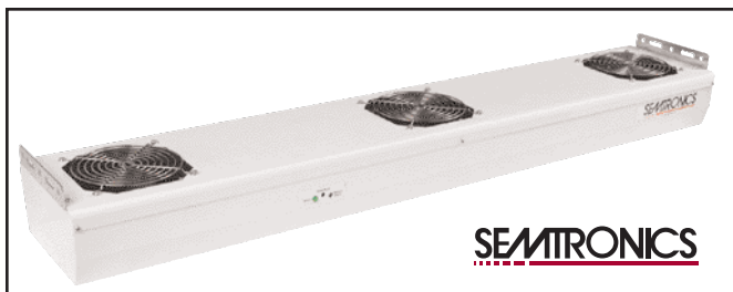
Figure 1. Semtronics Overhead Ionizer