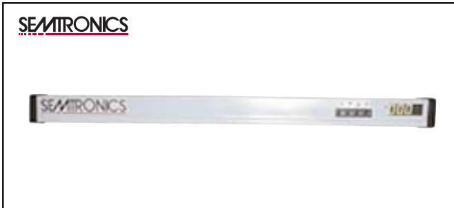
Figure 1. 62406 Pulsed Ionizing Bar

The Pulsed Ionizing Bar combines the effectiveness of pulsed DC ionization with the ease of adjustability, communication capability and the flexibility of a micro-controller based design to produce a versatile ionization system. The Pulsed Ionizing Bar uses pulses of positive and negative ions to produce extended ionization coverage with or without forced air- flow.