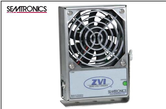
Figure 1. 62424 Mini Ionizer

The 62424 is an ultra-compact and lightweight dual steady state DC auto-balancing benchtop ionizer. This unit is small enough to be installed into any area needing to be neutralized. It may also be wall or shelf mounted. The ionizer's neutralization time will be best approximately 12" to 36" directly in front of the unit and will increase as the distance from the unit increases.