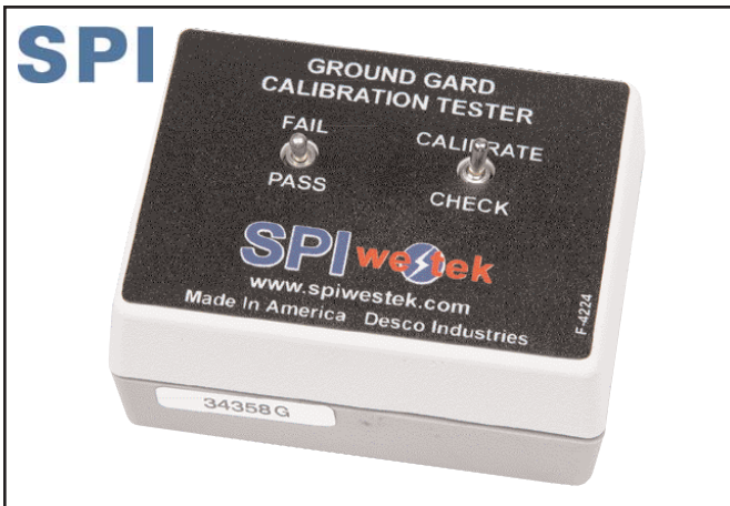
Figure 1. SPI 94335 Ground Gard Calibration Tester