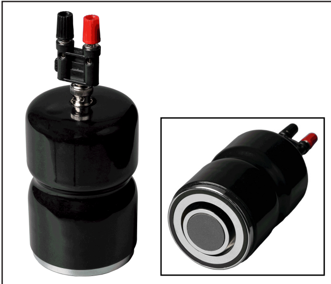
Figure 1. Desco 50005 Concentric Ring Probe