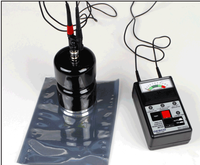
Figure 3. Using the Concentric Ring Probe with the Desco Analog Surface Resistance Meter