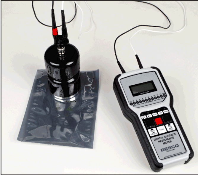
Figure 2. Using the Concentric Ring Probe with the Desco Digital Surface Resistance Meter