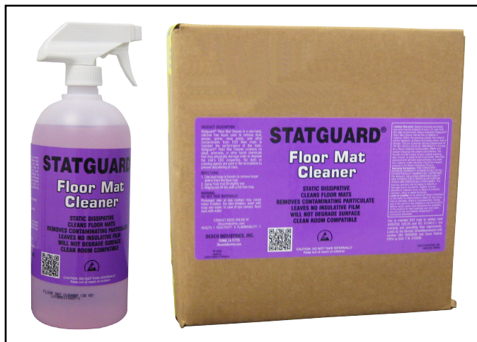
Figure 1. Statguard® Floor Mat Cleaner 1 Quart Spray Bottle (10443) 2.5 Gallons Bag-in-Box (10444) 5.0 Gallons Bag-in-Box (10445)