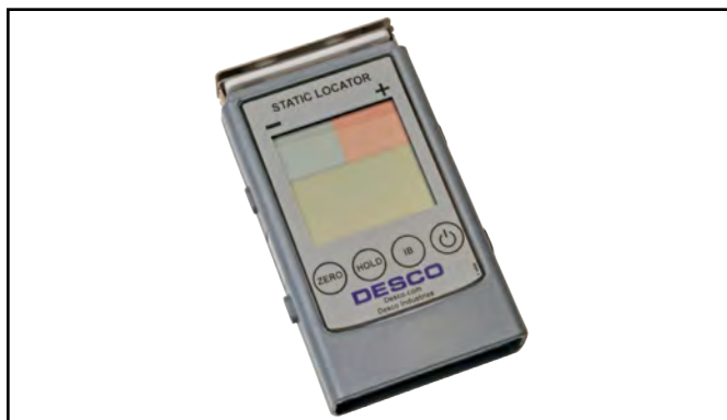
Figure 1. Digital Static Locator Item # 19430