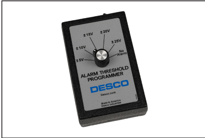
Figure 1. Desco 60508 Alarm Threshold Programmer