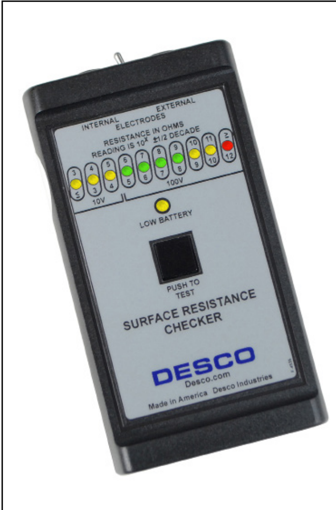
Figure 1. Desco 19640 Surface Resistance Checker