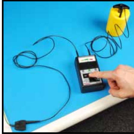
Figure 3. Using the test leads and one 5 pound electrode to measure RTG

CAUTION: If there is a current limiting resistor in the worksurface and the worksurface resistance is lower, the measurement will primarily be the resistance of the resistor. It is recommended to measure RTT particularly if the material color is black.