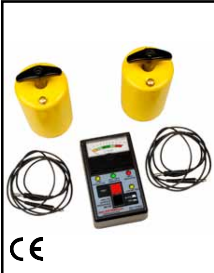
Figure 1. ESD Systems.com 41294 Analog Surface Resistance Test Kit